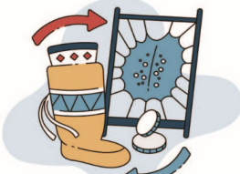
ρσΔϙρϙϙ ϙρϙϙϙϙϙϙϙ Healthy Economy Économie saine