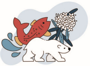
ϙσΔϙϙϙϙϙϙ ϙϙϙϙϙϙϙ ϙϙϙϙ ϙσΔϙϙϙϙϙϙϙ ϙρρρϙϙϙϙϙ Healthy Environment and Healthy Ecosystems Environnement et écosystèmes sains