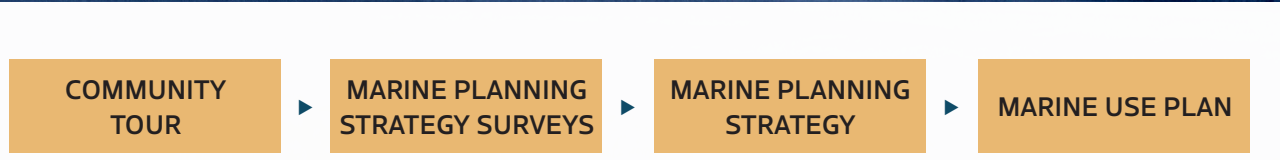
Fig 2: Actions to inform development of the Marine Use Plan for the NMR.

During the Community Tour we asked people their opinions on their preferred methods of engagement and how to effectively incorporate feedback into the work of the NMRPC. We used comments from the Community Tour to create a Targeted Survey for experts in the marine environment; a Public Survey for all Nunavik Inuit, Nunavimmiut, and others interested in the NMR; and an Organization Survey for other planning partners. The feedback from the surveys will be used to inform our next step in the process: the Marine Planning Strategy.