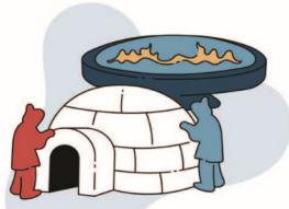
ΔσΔϙ Δσρϙρϙϙϙϙ ϙσϙϙϙ Healthy People and Community Peuples et communauté sains

Values for the NMRPC were developed at an internal workshop with Board members and staff. During discussions, four themes were adopted as draft values of the NMRPC. The group worked to ensure Inuktitut terms were selected that would capture the spirit of each value and identified goals to go along with each.