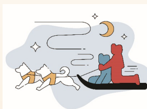
ρϙϙϙϙϙϙ ϙϙΔρϙϙϙϙϙ Integrity & Inclusion Intégration et inclusivité