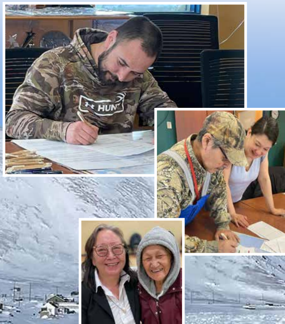
Fig 3: Successes of the Nunavik Marine Region Planning Commission's (NMRPC's) 2023 community tour.