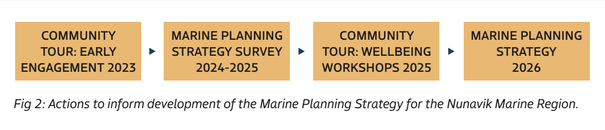
Fig 2: Actions to inform development of the Marine Planning Strategy for the Nunavik Marine Region.

— NMRPC Social Media Post from January 2023