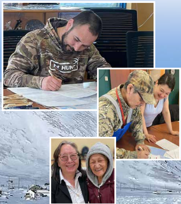
Fig 3: Successes of the Nunavik Marine Region Planning Commission's (NMRPC's) 2023 community tour.