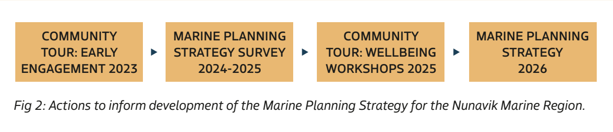
Fig 2: Actions to inform development of the Marine Planning Strategy for the Nunavik Marine Region.

— NMRPC Social Media Post from January 2023